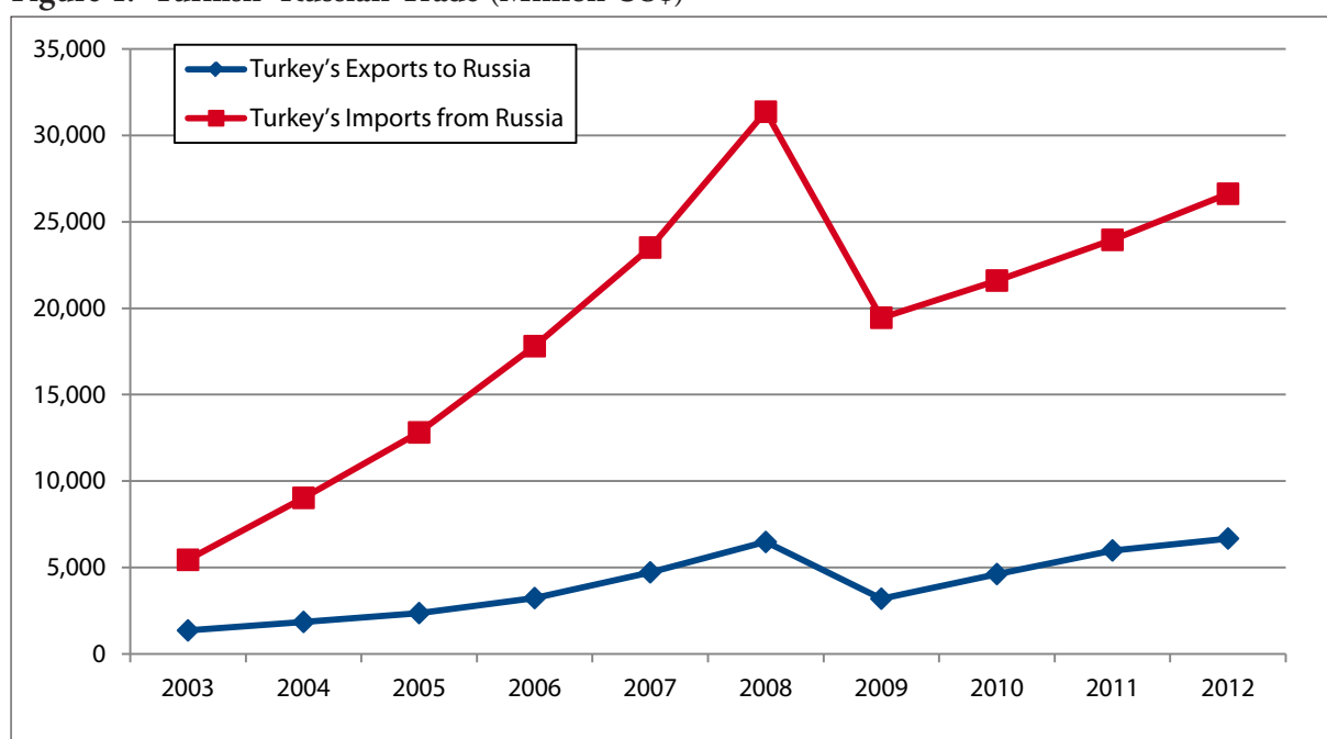
Figure 1: Turkish–Russian Trade (Million US$)